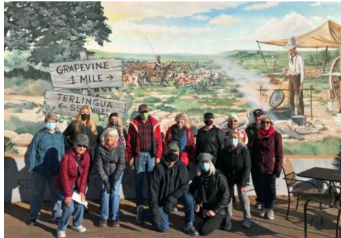
Posing in front of a mural.