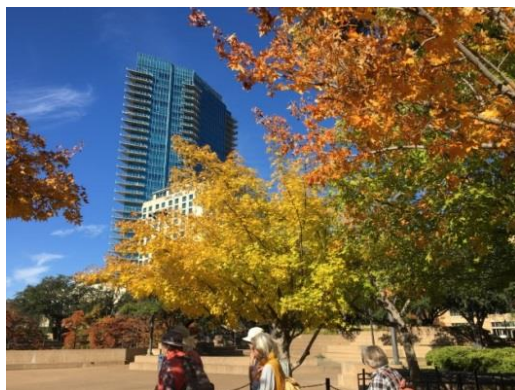
Beautiful fall color in Fort Worth.