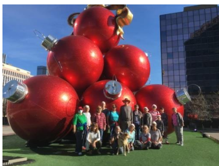
Tuba Christmas Walk