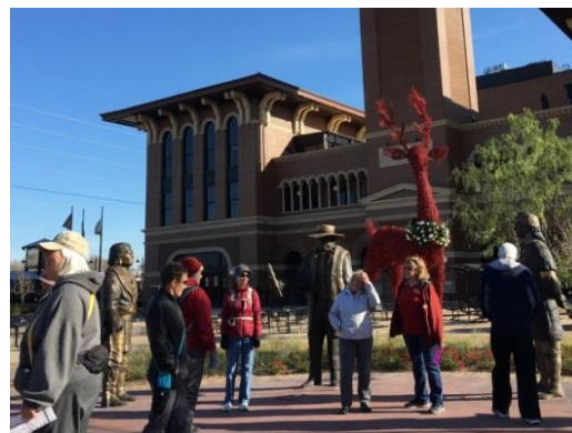
Taking a break in Grapevine.