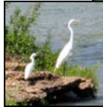
Abundance of waterfowl