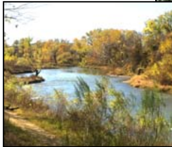
Elm Fork of the Trinity River