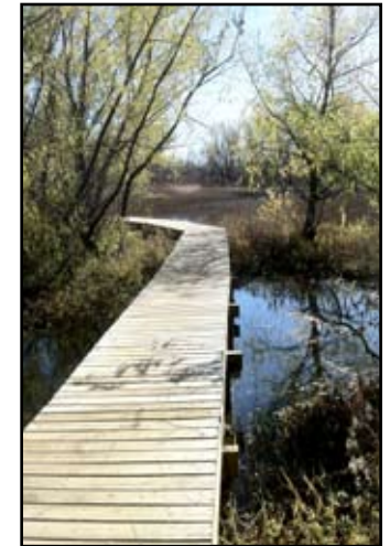
Boardwalks over the Bittern Marsh