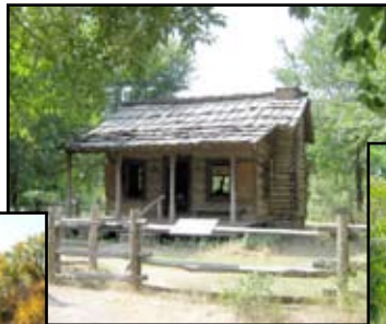
Minor-Porter Log House