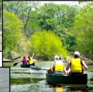
Beaver Pond Kayak Trail