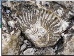
Fossil of an ammonite shell found on Fossil Ridge Trail near limestone quarry.