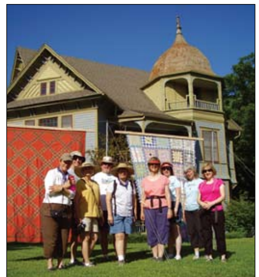
Left: Banner and busy start point for the Liberty Fest Walk in Farmer's Branch on May 29th. Right: Group walk participants in front of a historic gingerbread house on Main Street in Waxahachie on June 5th.