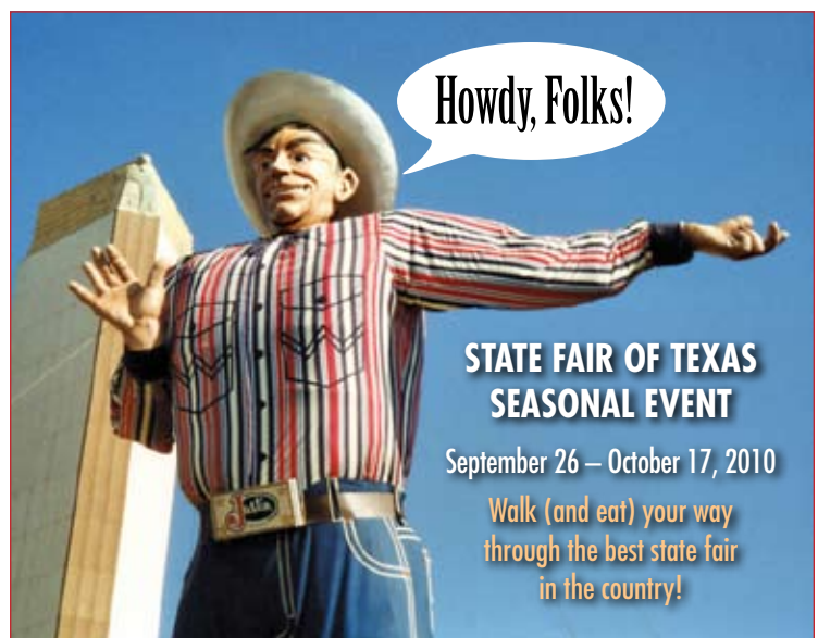
Big Tex made his debut at the State Fair of Texas in 1952. He's undergone a few makeovers since then, but he remains a memorable and iconic figure.

For those who prefer company, we'll set up some group walking times. Of course, you can go on your own or grab a couple of friends to take with you. Use the Dallas Area Rapid Transit (DART) Green Line for convenience. Watch or listen to local media for discounts. Visit the official website, www.bigtex.com , for schedules and full lists of everything the State Fair has to offer. See you there!