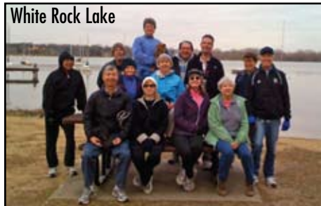
White Rock Lake