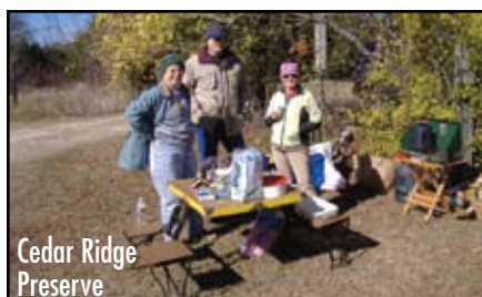
Cedar Ridge Preserve