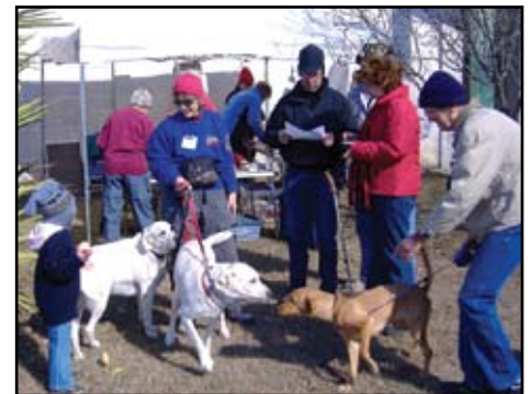
Left: Trekkers enjoy Cajun food and live blues at the Alligator Cafe during the November membership social. Right: Walkers and their four-legged friends visit near the start table at the Cedar Ridge Preserve event in November.