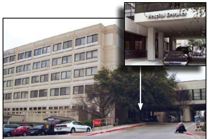
Doctors Hospital from Poppy Drive. The doorway marked "Hospital Entrance" (see inset) leads to the lobby and the Communication Office (Room 112) where the walk box is kept.